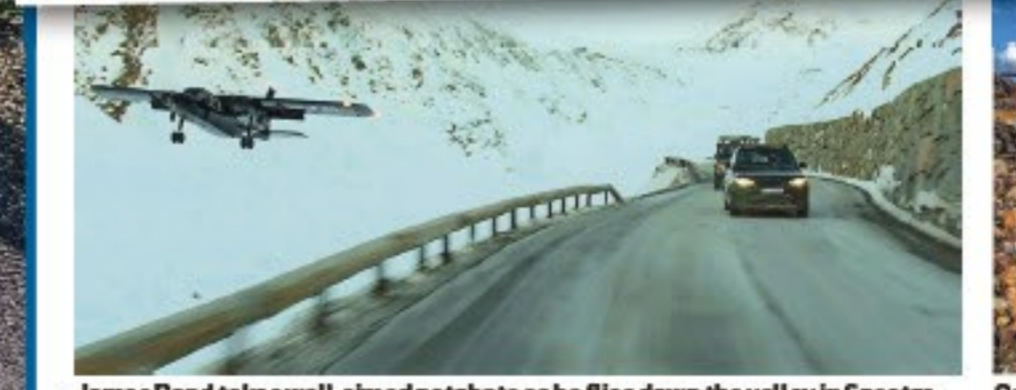
James Bond takes well-aimed potshots as he flies down the valley in Spectre