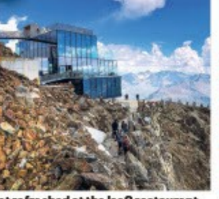
Get refreshed at the IceQ restaurant