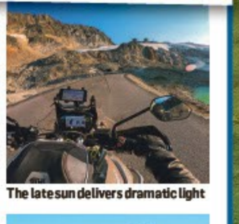
The late sun delivers dramatic light