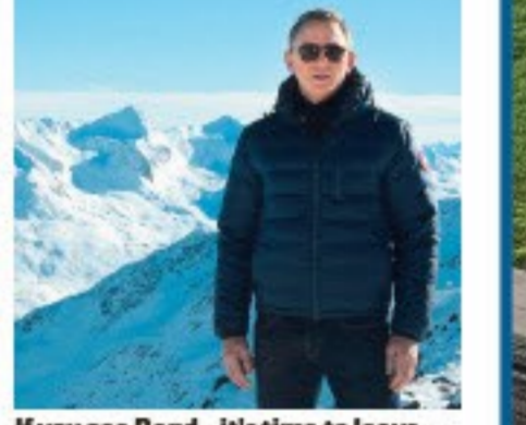
If you see Bond - it's time to leave...