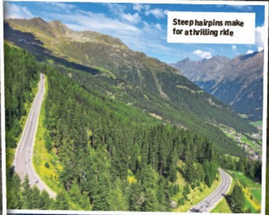
Steep hairpins make for a thrilling ride