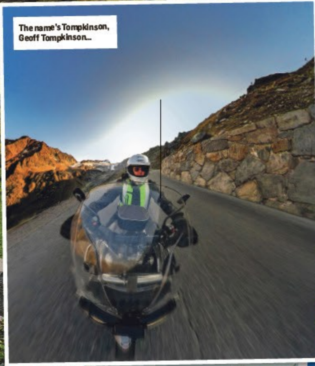
The name's Tompkinson, Geoff Tompkinson...

The Ötztal Gletscherstrasse (glacier road) starts in Sölden, just after the village centre on the right when heading south. The signpost says 'Tiefenbach Gletscher' and 'Rettenbach Gletscher'. It's a high alpine road with several switchbacks and hairpin bends. It goes from Sölden (1368m) to the Rettenbach Glacier and then through the highest road tunnel in Europe to the Tiefenbach Glacier (2830m). Beware of ice in the tunnel. The Ötztal Gletscherstrasse is the highest panoramic road in the Eastern Alps and the highest paved road in Austria. The road is normally open for motorcycles from June to September, check opening hours for the road on www.soelden.com . This is a toll road and the fee is €10.50 per motorcycle.